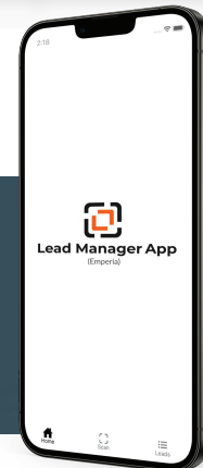
Lead Manager App